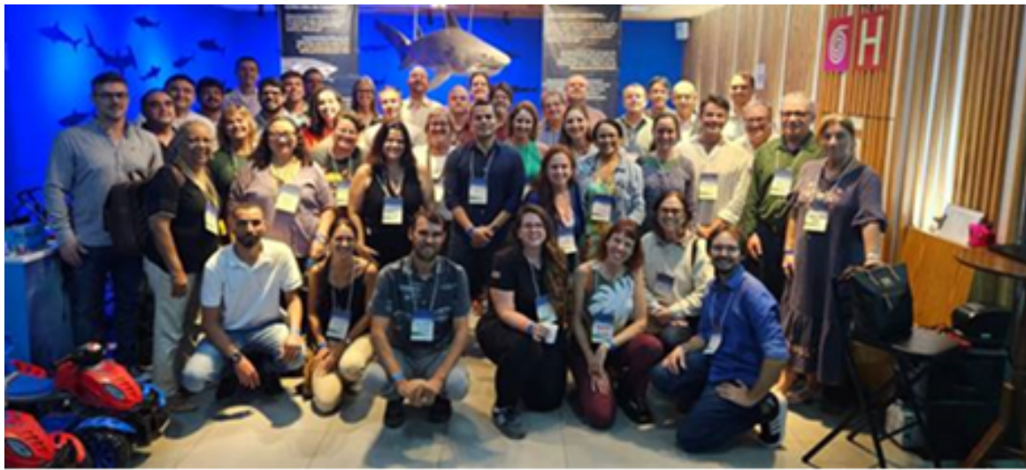
© GIZ Brazil | TerraMar Project | Photo of a group of people in an indoor setting with direct light above them. In the background, blue wallpaper with dark blue fish designs.

Representatives from 13 coastal states, academia, civil society, the National Council of Traditional Peoples and Communities (CNPCT), and government officials gathered at the National Workshop on Integrated Coastal Management (GERCO) on March 26th and 27th at AquaRio in Rio de Janeiro. The event marked the resumption of this agenda in Brazil.