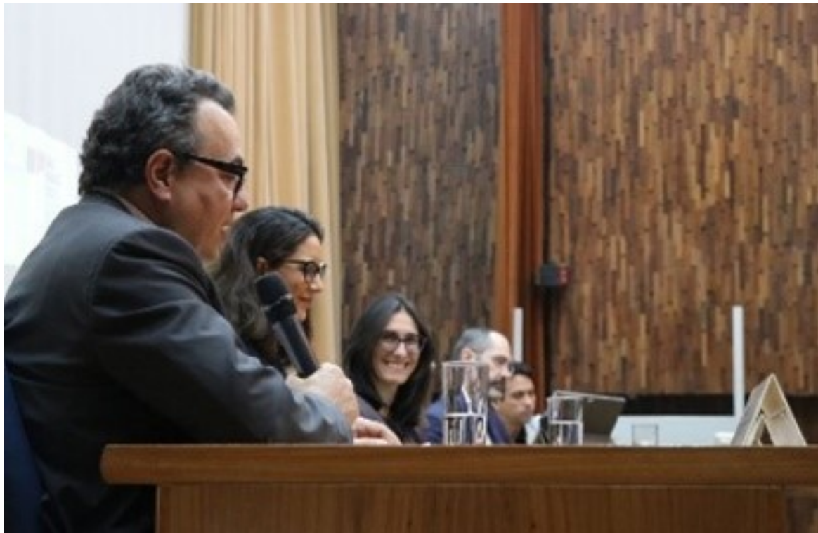
Photos from the FAEE launch event.