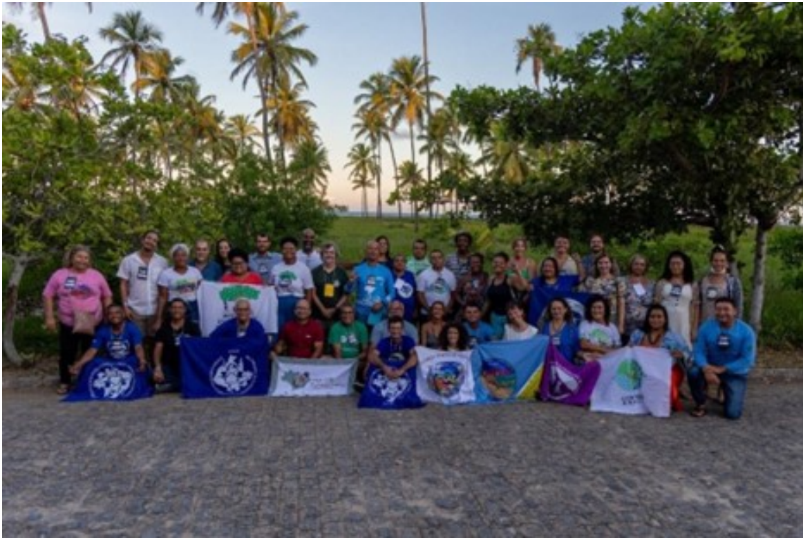
A photo of women and men smiling at the camera and holding up various flags representing their groups and institutions. In the background, trees and green vegetation, and, in its centre, a small glimpse of the sea.

Two regional workshops aimed at developing Brazil's National Programme for the Conservation and Sustainable Use of Mangroves (ProManguezal) were held, on March 23rd and April 6th in Belém (PA) and Tamandaré (PE), respectively.