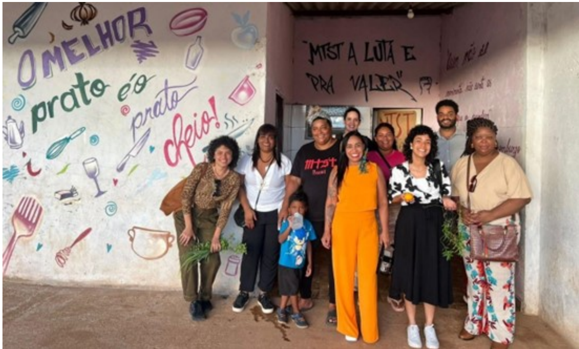
@loba.makua | 10 people smile for the photo in a large, naturally lit room with graffitied walls

The Black Women for Climate Mentorship team, part of the ANDUS Project, was in Brasilia from May 13th to 16th, initiating their visits to the territories of the selected leaders.