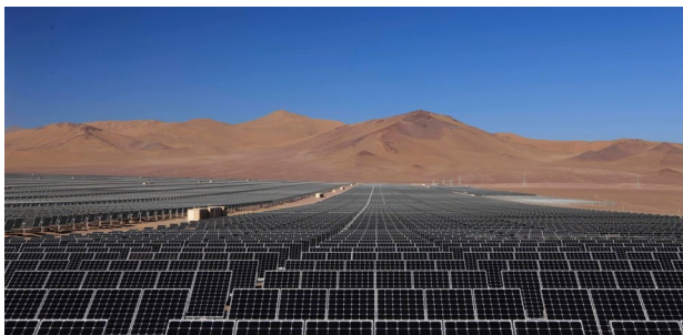
Photovoltaic park in the Antofagasta region